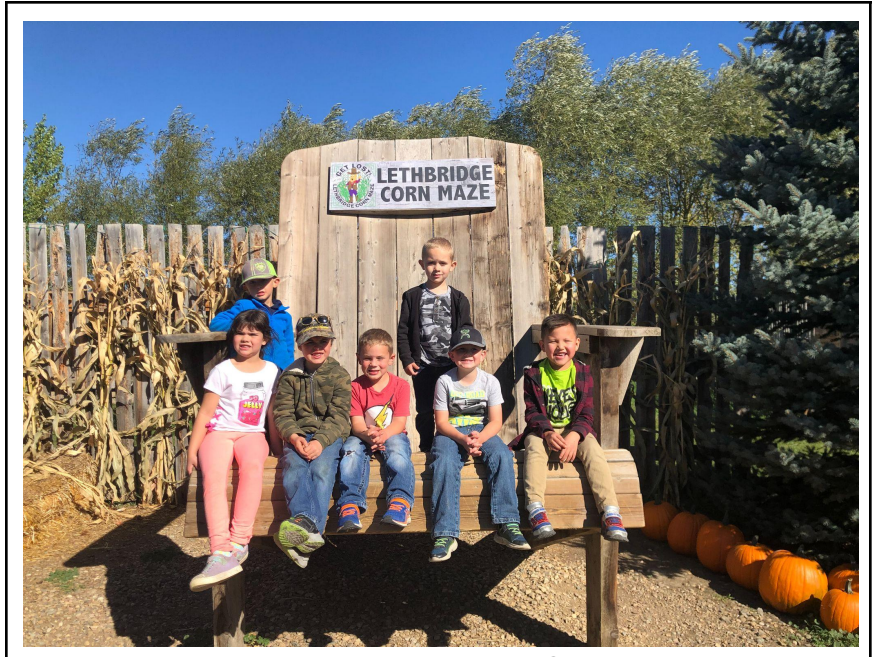
Kindergarten trip to the Corn Maze