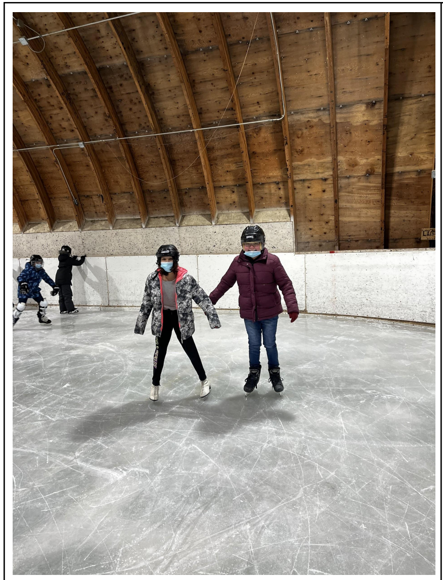
Skating on the natural ice rink