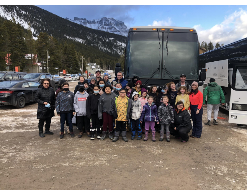
Castle Mountain Ski Trip