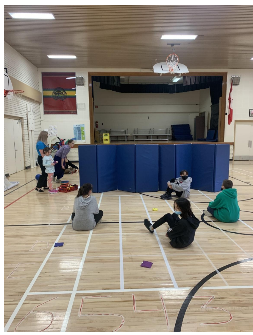
Human Battleship for Pi Day