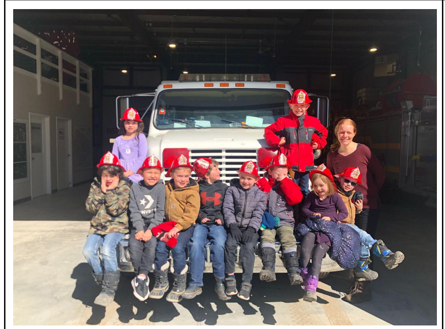
Milo Alphabets visit the Fire Hall