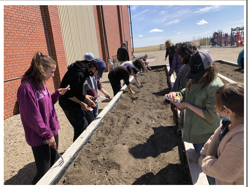
Planting our garden